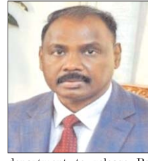
department to release Rs 1,000 to each of the 3.50 lakh workers registered with Building & Other Construction Workers Welfare Board for purchase

STATE TIMES NEWS JAMMU: The Lt Governor G.C Murmu approved a series of proposals to provide support to the needy and destitute in the light of the extraordinary situation caused by the ongoing Corona pandemic and the consequent lockdown. The move is expected to benefit nearly 35 lakh people including organised and unorganised workers, daily wagers, pension holders and ordinary citizens. The LG directed the Labour & Employment department to release Rs 1,000 to each of the 3.50 lakh workers registered with Building & Other Construction Workers Welfare Board for purchase