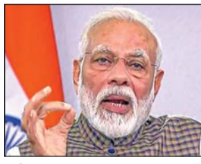
hour. If he claimed that all is well, then he would be deceiving himself, the prime minister said, and then added that what is a more important question is that whether the pandemic has to be defeated or not even if it means facing certain difficulties. Even in normal times, people face certain problems, he said. Noting that 'Navaratri' has started from Wednesday, he asked people to take care of nine poor families on each of the nine auspicious days, saying nothing can

STATE TIMES NEWS NEW DELHI: Prime Minister Narendra Modi on Wednesday warned of tough action against those misbehaving with people on the frontline of the fight against coronavirus like doctors and airline crew, and sought the cooperation of citizens with the administration to deal with the crisis. Modi chose a video interaction with residents of Varanasi, the constituency he represents in Parliament, to respond to several queries related to the pandemic and his government's response to it, and asserted that focusing on a few incidents of shortcomings will not help at this