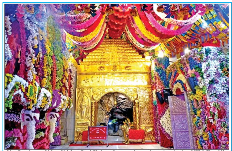
Live Darshans of Mata Vaishno Devi Shrine after morning and evening Aarti at MH 1 Shradha channel during Navratras. The Aarti timing is 6.30 AM to 8.00 AM & 6.30 PM to 8.00 PM.