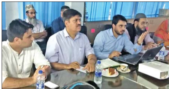
Workshop on Potential Linked Plan 2019-20 in progress.