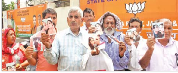
Family members of the girl allegedly kidnapped by the BJP MLA staging protest.

"I am before you and nobody kidnapped me. The allegations are fake. He (MLA) is a very good person. My family are supporters of PDP and may be that is the reason... They are forcing me to marry someone who has not even clear his 12th class while as I am doing BAMS," she had said.