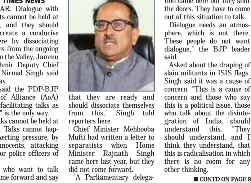
Talks with separatists cannot be held at gunpoint: Dy CM