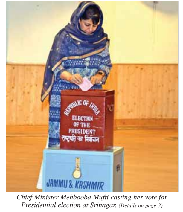
Chief Minister Mehbooba Mufti casting her vote for Presidential election at Srinagar. (Details on page-3)

STATE TIMES NEWS SRINAGAR: Finance Minister Haseeb Drabu on Tuesday set mid-August as the operational target for traders in the state to migrate to the GST as he directed the administration successfully implement the new tax regime. "The biggest deterrent in the implementation of GST was the apprehension within the business community about erosion of the state's fiscal autonomy which has been taken care of," he said during a meeting here. "Now, the government functionaries at district level must take traders, businessmen, small scale industries and consumers on board for smooth transition from VAT to GST and they should achieve these targets by mid-August," he added. Drabu set the immediate operational target to achieve cent percent registration of businesses under GST and directed the district administrations to work towards successful implementation of the new tax regime in the state which will be beneficial for the consumers. "All stakeholders should register for the GST which is not just a tax number but business identification number that will strengthen the trade and establish them within their respective sectors, market places and CONTD ON PAGE 9