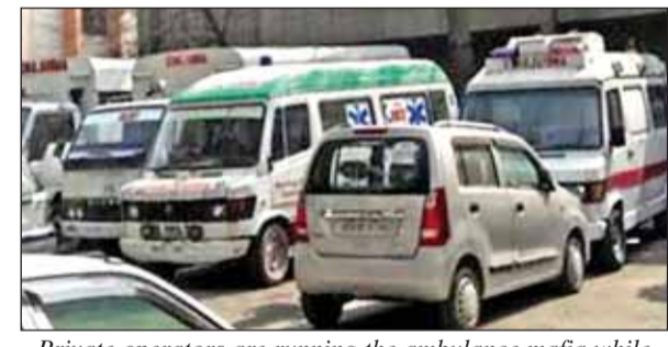
Private operators are running the ambulance mafia while brand new ambulances are lying unutilized for last many years in the premises of Directorate of Health Services Jammu.