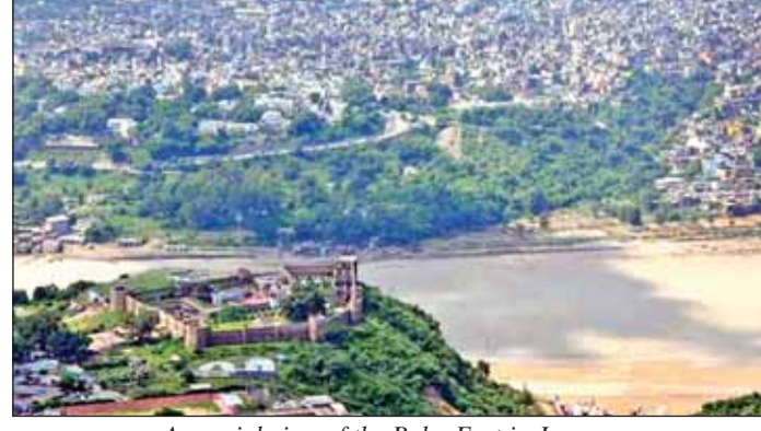
An aerial view of the Bahu Fort in Jammu.

going to be lingered due to non-agreement of both the coalition partners on giving final nod to its name," sources here said. Sources however, said that for BJP and the people of Jammu as well, the project may be familiar as 'Mubarak Mandi-Bahu Fort' but in papers, the works on the project are being executed as 'Shahabad Cable Car Project'. "In one of the recently issued notifications by the project executing agency, Jammu and Kashmir State Cable Car Corporation Limited, a tender has been invited for the work with a mention in an order reading as 'Construction of wall on entry side of Shahabad Station of Jammu Cable Car Project at Shahabad, Jammu', clears the dust from many queries," sources added.